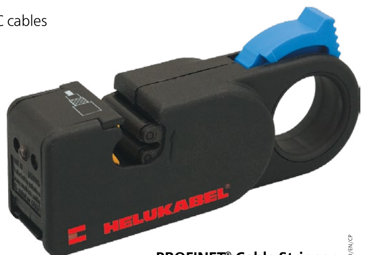
PROFINET® Cable Stripper Part No. 801497

Knife cartridges for other cable types or constructions