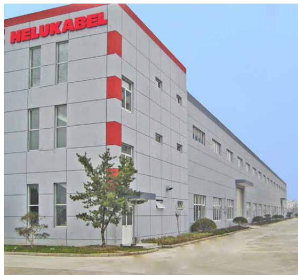
HELUKABEL® production and logistics centre in Taicang / China

With 4 locations, HELUKABEL is represented in the most important economic regions along the east coast. This includes Shanghai located in the Yangtze delta, the metropolitan area of Beijing as well as the so-called Pearl River delta in the Guangdong province with the special economic zone Shenzhen . This is where more than 30 expert consultants are available for you with advice, of course also in German and English.